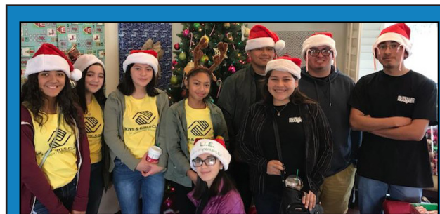
Keystone and Torch Club members decorated Christmas Stockings and delivered them to the Windsor Gardens Rehabilitation Center.

GANG PREVENTION SUMMIT - 264 youth and families attended our Gang Prevention Summit, which featured guest speakers, panelists, and a resource fair. The Summit helps youth develop a sense of determination, self reliance, and teaches them how to make wise choices.