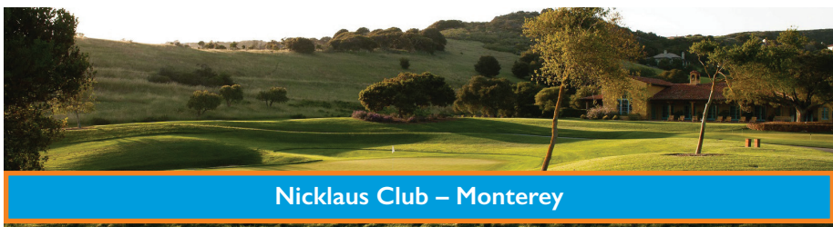
Nicklaus Club – Monterey