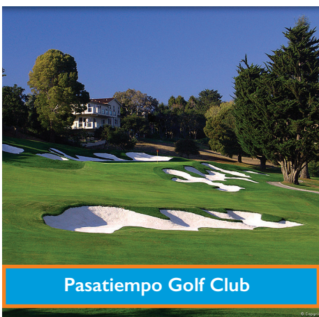
Pasatiempo Golf Club