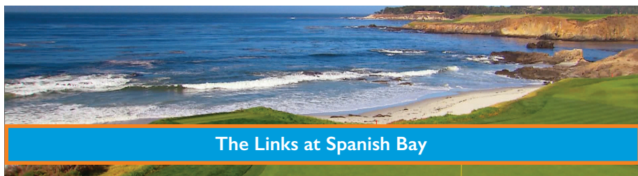
The Links at Spanish Bay