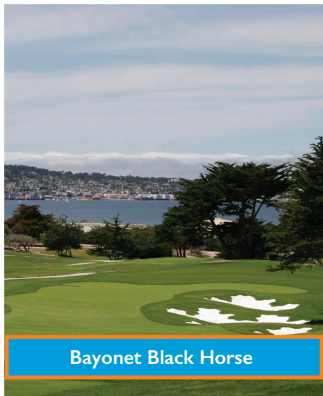
Bayonet Black Horse